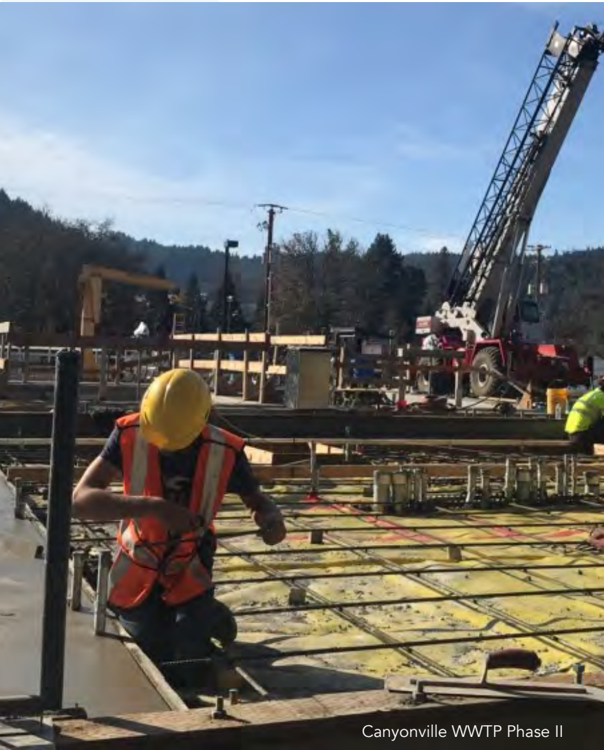
Canyonville WWTP Phase II